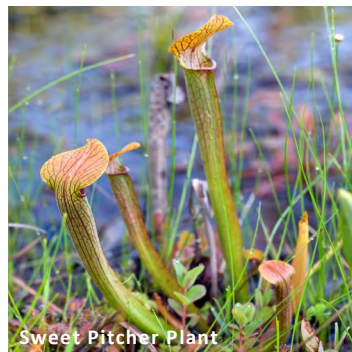
Sweet Pitcher Plant

CFLCP Partners recognize the full rights of individual land managers and neighboring private property owners to pursue their own interests and objectives on their land.