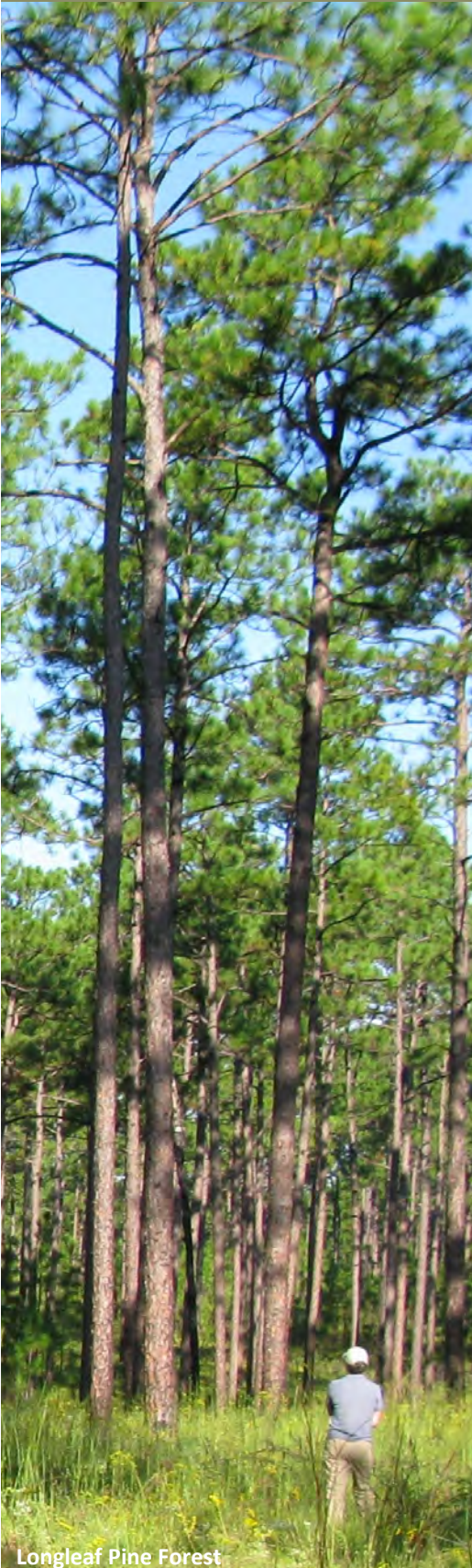
Longleaf Pine Forest

The Chattahoochee Fall Line Conservation Partnership believes that by working together we can leave future generations in West Georgia and East Alabama with healthy land, clean water and a strong rural economy.